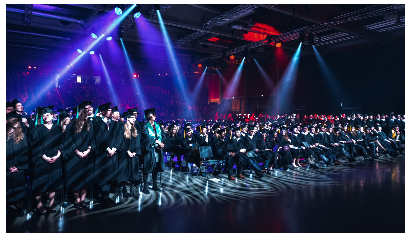
Over 400 alumni - dressed in traditional costumes - were bid farewell by DIT.