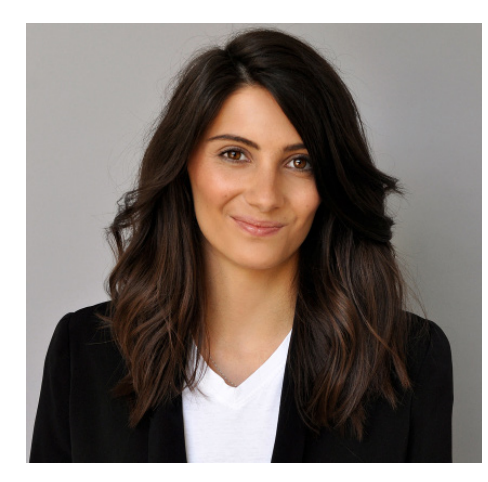
Background and current projects:

In autumn 2018, I finished my master in Media Technology at DIT. I wrote my final thesis at the online agency Diva-e in Munich about search engine optimization for Java-Script based websites. Afterwards, I spent a few